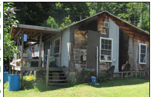
Until a World Vision team came, the woman who lives here raised five children in a home that had no running water for 20 years.

He provided comfortable accommodations for us on a beautiful college campus. He opened our eyes to some of the issues of the people of this region and permitted us to see what we could begin to do to truly help. He provided flights, hotel, ground transportation and numerous other trip costs, all under budget. With the excess funds we were able to purchase food, clothing, construction supplies, school and craft supplies that will benefit many. Talk about the loaves and the fishes. With our budget I was concerned that we would not be able to pay for our trip with the fee we collected but he led our way and gave us excess through donations above what we asked. In addition to all the gifts we brought, He took our funds and multiplied them and