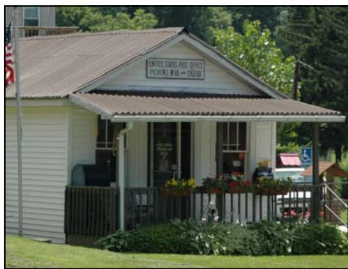
Post Office in the town of Pickens, WV

is it possible that 37 people came from our church, neighboring churches, drove from Atlanta, Arizona, Missouri and Indiana all to serve in West Virginia? I wouldn't even know how to begin to make all that happen, but He did. He chose who should serve and who should be served.