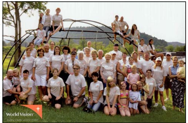
Mission team of 37 with some of the families we served

How is it possible that two people who have never led a mission trip before were able to partner with World Vision to serve an Appalachian community? How is it possible that we were given so many gifts that not only served the children and families of Philippi, West Virginia but we had such abundance that we served hundreds of others in California, Haiti and Mexico and many of our partner ministries? How