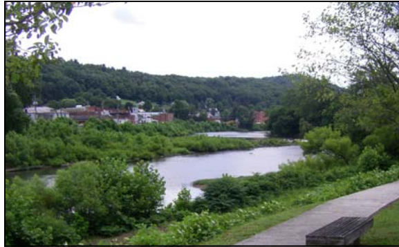
The community of Philippi, West Virginia

When God wants to work in your life, he'll always give you a dream—about yourself, about what he wants you to do, about how he's going to use your life to impact the world. How do you know when a dream is from God or when it's just something you've thought up yourself?