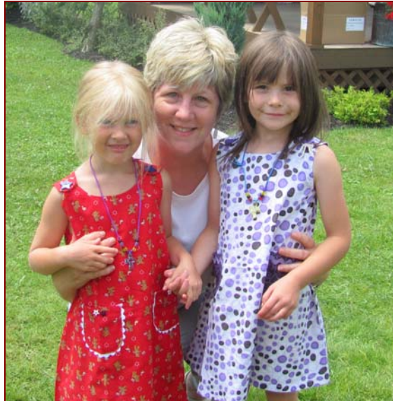
Two little girls from the Appalachian community of Pickens with one of the local pastors wearing sundresses made by the ladies from Calvary's blanket ministry.

The greatest enemy of best is "good". If you're willing to accept "good" you'll never be the "best". Charles Kaiser