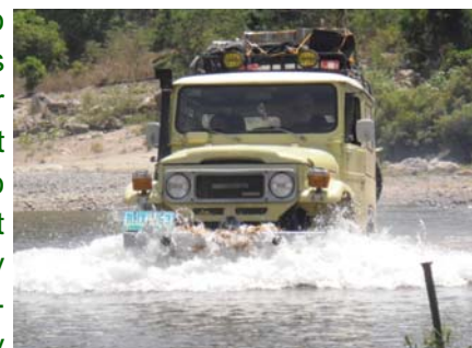
Landcruiser delivering much needed supplies to a remote village.

only allows them to be on the roads (which are safer than the trails) but also allows them to transport items that are too big or heavy to carry to the remote villages they serve. "Praise God, we helped the whole community, we left a good witness for Jesus, and we led twelve to the Lord! Hallelujah!